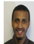
Anteneh Zewde Gondar College of Medical Sciences